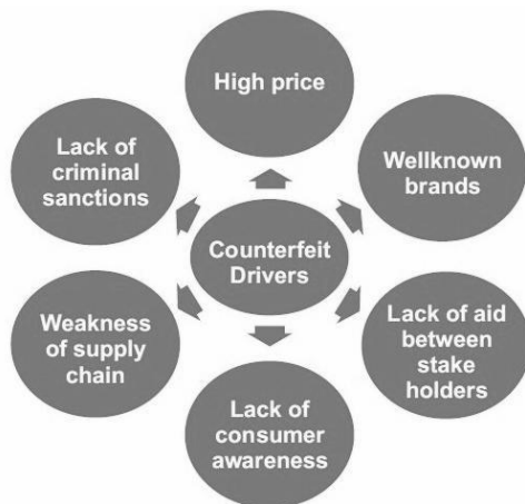
Fig. 1.1 Challenges in counterfeit elimination

We now have more fakes than real drugs in the market. — Christophe Zimmermann, the anti-counterfeiting and piracy coordinator of the World Customs Organization [6]. Current anti-counterfeiting supply chains rely on a centralized authority to combat counterfeit products. This architecture results in issues such as single point processing, storage, and failure. Blockchain technology has emerged to provide a promising solution for such issues. In this paper, we propose the block-supply chain, a new decentralized supply chain that detects counterfeiting attacks using blockchain and Near Field Communication (NFC) technologies. Block-supply chain replaces the centralized supply chain design and utilizes a new proposed consensus protocol that is, unlike existing protocols, fully decentralized and balances between efficiency and security. Our simulations show that the proposed protocol offers remarkable performance with a satisfactory level of security compared to the state of the art consensus protocol Tendermint.