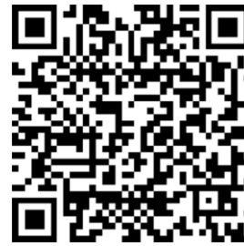
Fig. 3.1 Example Product QR code

In perspective of a user, a user is able to do the following thing in the specified order to check the authenticity of the product.