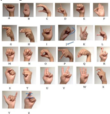
Figure 1 American Sign Language alphabets

And despite having an accuracy of over 90%[3], wearing of gloves are uncomfortable and cannot be utilised in rainy weather. They are not easily carried around since their use require computer as well. In this case, we have decided to go with the static recognition of hand gestures because it increases accuracy as compared to when including dynamic hand gestures like for the alphabets J and Z. We are proposing this research so we can improve on accuracy using Convolution Neural Network(CNN)