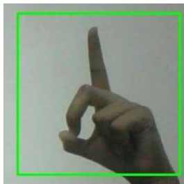
Figure 3 (a) Image captured from web-camera.

Since the images obtained are in RGB colourspaces, it becomes more difficult to segment the hand gesture based on the skin colour only. We therefore transform the images in HSV colourspace. It is a model which splits the colour of an image into 3 separate parts namely: Hue, Saturation and value. HSV is a powerful tool to improve stability of the images by setting apart brightness from the chromaticity [15]. The Hue element is unaffected by any kind of illumination, shadows and shadings[16] and can thus be considered for background removal. A track-bar having H ranging from 0 to 179, S ranging from 0-255 and V ranging from 0 to 255 is used to detect the hand gesture and set the background to black. The region of the hand gesture undergoes dilation and erosion operations with elliptical kernel. The first image is obtained after applying the 2 masks as shown in fig 3(b).